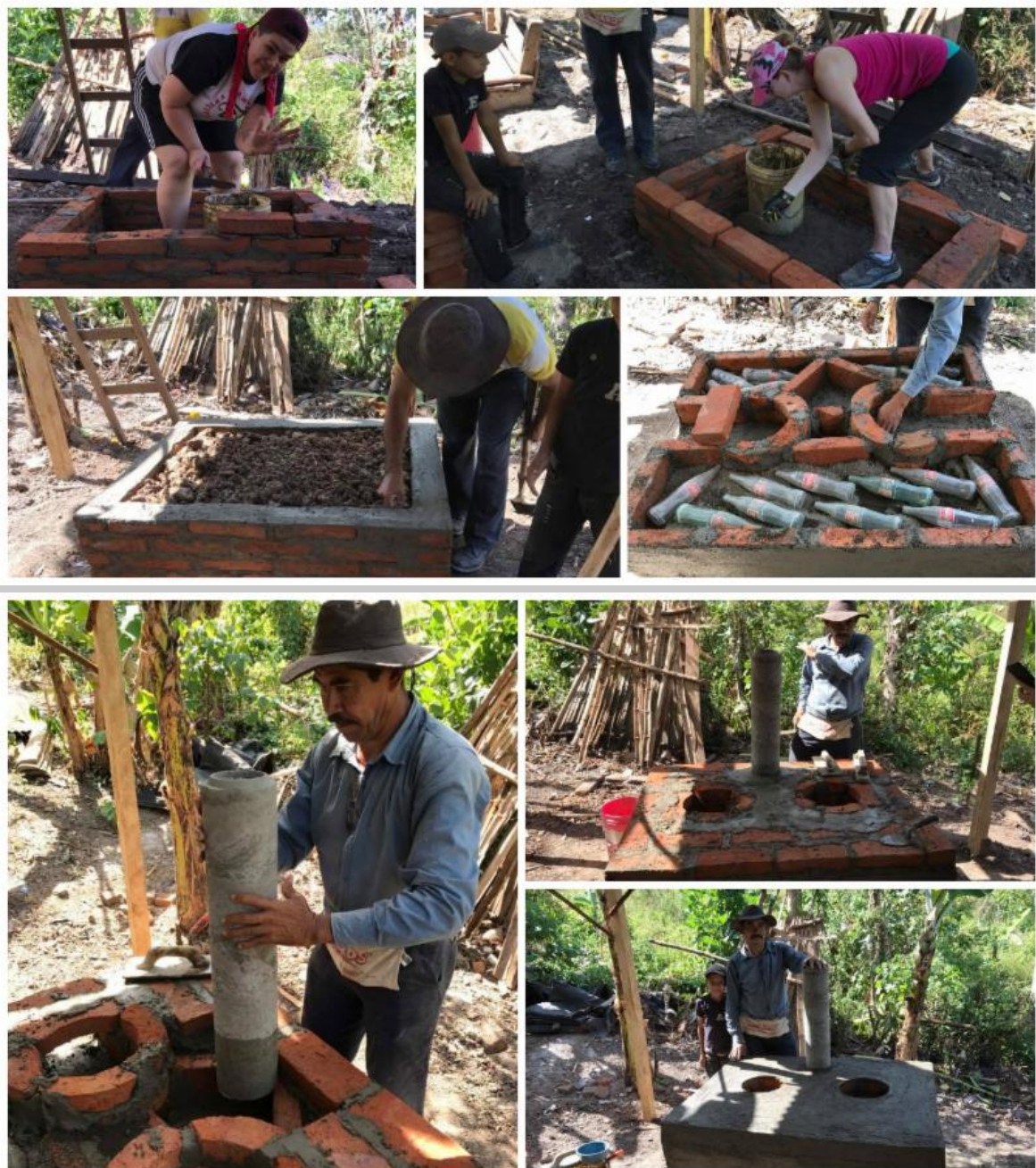
Partners helping build a "green" stove.

Here are some JustHope Partners from Phoenix, AZ showing you the steps to build a "Green" Stove in La Flor! The process is slightly different in Chacraseca, but the results are the same!