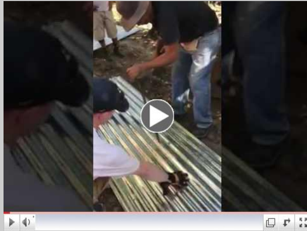
Building a "Green" Stove with a Machete!

The last step is adding the tin roof over the new kitchen, but first the chimney hole needs to be cut into the tin. Watch it happen with every Nicaraguan farmer's favorite tool for every job - a machete!