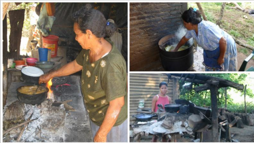
A traditional way of cooking.